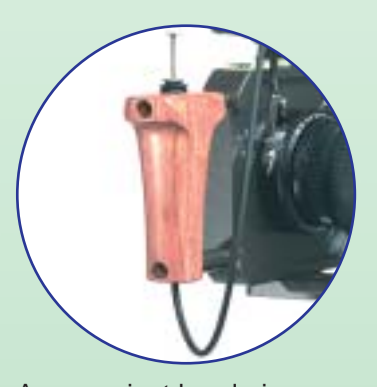
A convenient handgrip assures a firm holding of the camera even with the heaviest lens.